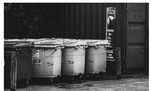
HOUSEHOLD HAZARDOUS WASTE COLLECTION (HHW)