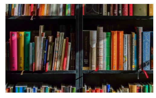
FUNDRAISER FOR THE QUYON LIBRARY